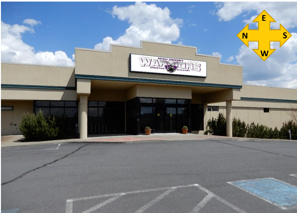
Loper Street Entrance Sign