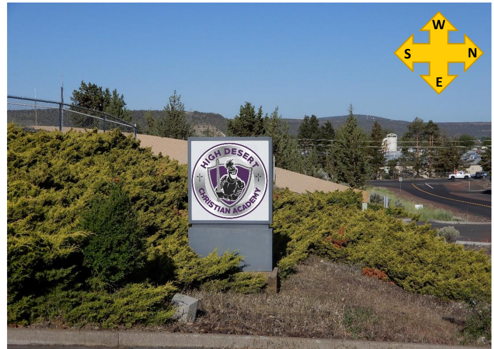
Loper Street Monument Sign