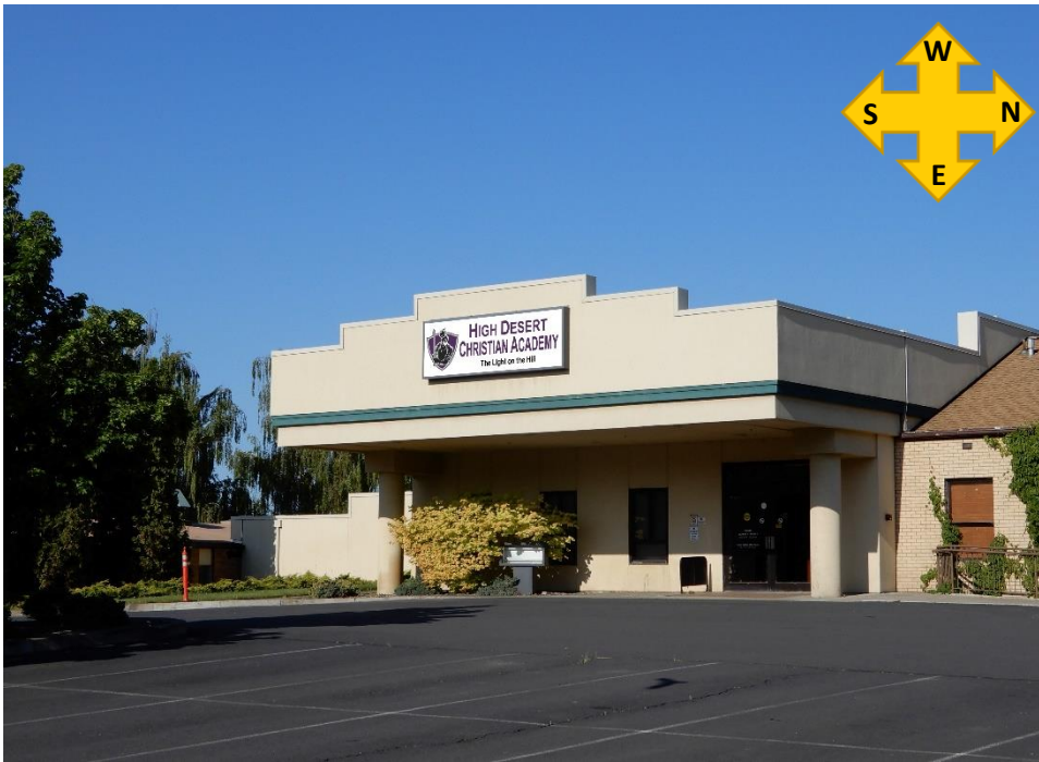
Elm Street Entrance Sign