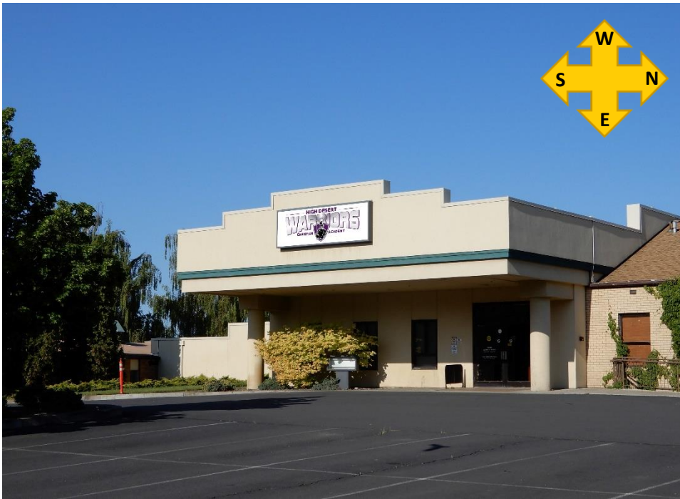
Elm Street Entrance Sign