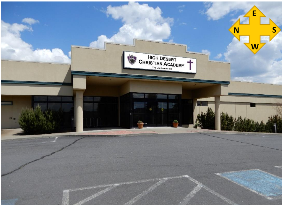
Loper Street Entrance Sign