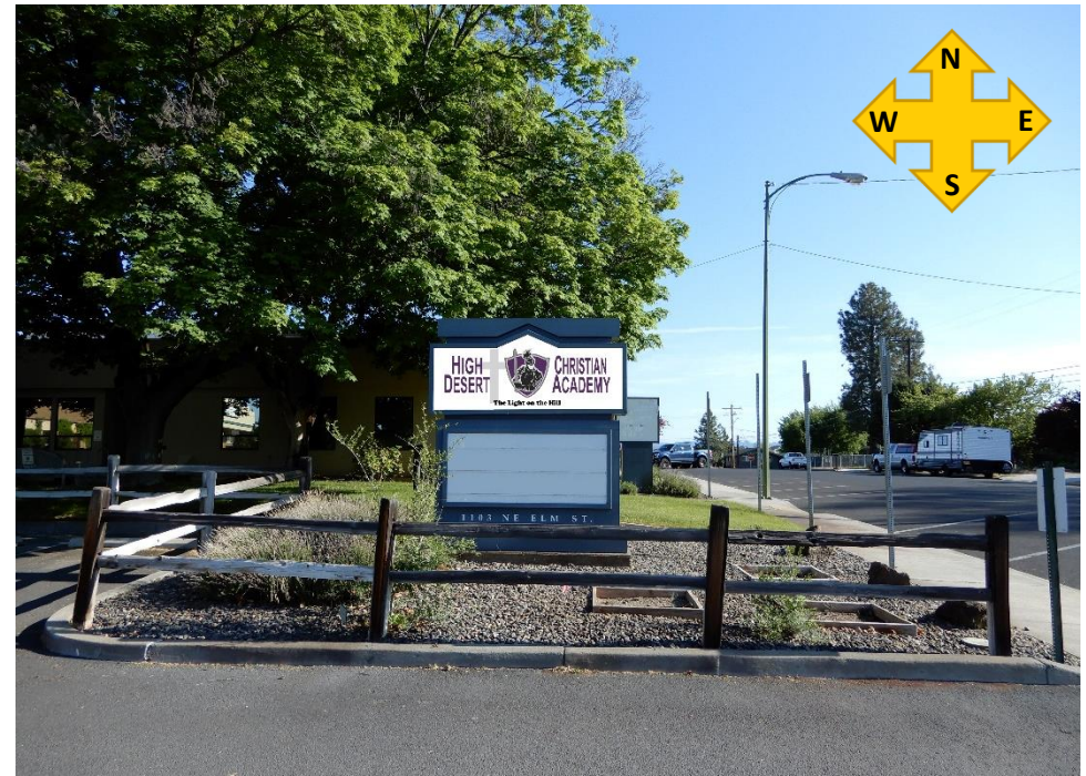
Elm Street Monument Sign