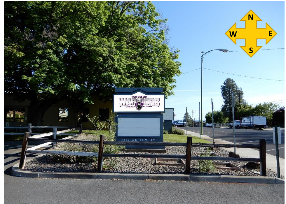
Elm Street Monument Sign